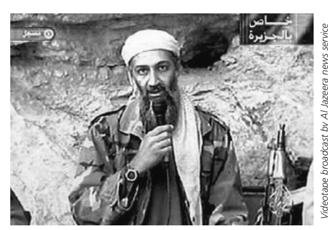
Osama bin Laden, the world's most famous radical Islamist, used modern video technology to bring his message to the world in October 2001.

Osama bin Laden may have operated from a cave in one of the least-developed countries in the world, but his radical Islamic movement is thoroughly modern. In many ways, radical Islamists are a mirror image of Islamic liberals, whose peaceful struggle to establish democracy is actually more popular.