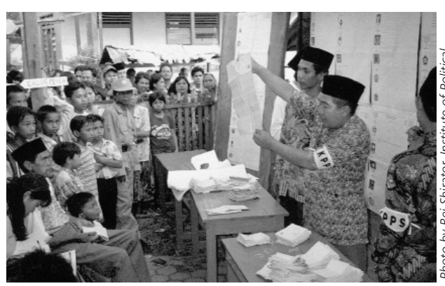
Election officials count votes publicly in a village in Indonesia. In this 1999 election, non-Islamic parties won a majority of the overall vote, and liberal Islamic parties received almost twice the support given to more radical parties.

The Taliban reintroduced tradition; Khomeini and other Islamists reinvented it. This process is entirely consistent with the "invention of tradition" identified by historians Eric Hobsbawm and Terence Ranger. The Victorians in England, for example, developed anthems, symbols, and a mythical lineage that they then projected backward in time, pretending that these were the outgrowth of an ancient tradition. Similarly, the Islamists' ideals of early Islamic society are contemporary constructions. The Islamists wish to return to God's law and the sacred practices of the first Muslims, but they downplay early Islamic practices such as slavery that are at odds with their modern values. In place of the clear social hierarchies in early Islam based on tribe, lineage, and seniority, Islamists emphasize human equality. In place of personal regimes, Islamists insist on codified law. In place of submission to authority, Islamists speak the language of individual rights. These modern values set Islamists apart from their precursors in earlier periods, such as Ibn Taymiyya in the 14th century and Muhammad Ibn 'Abd al-Wahhab and Shah Wali-Allah in the 18th century.