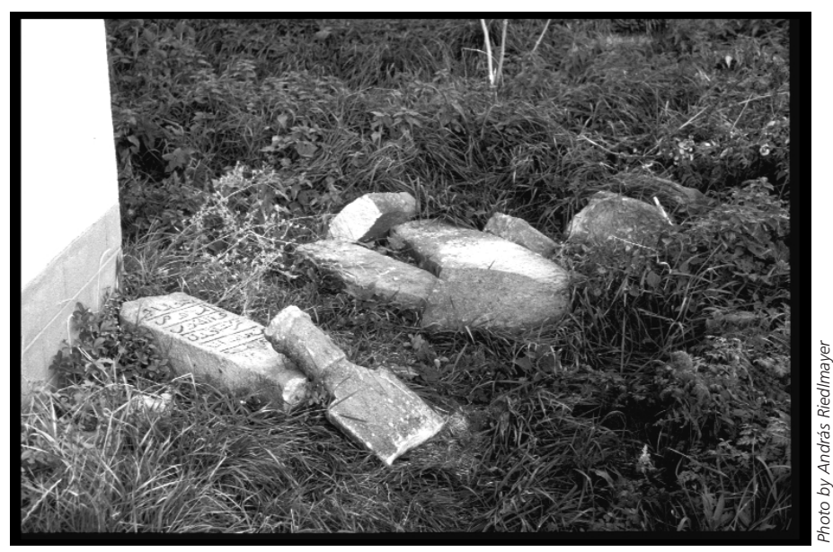
Toppled Muslim tombstones in a Kosovo graveyard desecrated by local Islamists.

mal education in 1960; by 1990, this figure had been reduced to 44 percent. In 1960, only four of these countries had more than 1 percent of the adult population with some higher education; in 1990, only four of these countries had less than 1 percent with some higher education. Seminaries have grown, too, in some countries; but even where seminarians control the state, as in the Islamic Republic of Iran, these schools remain marginal to the nation's educational system.