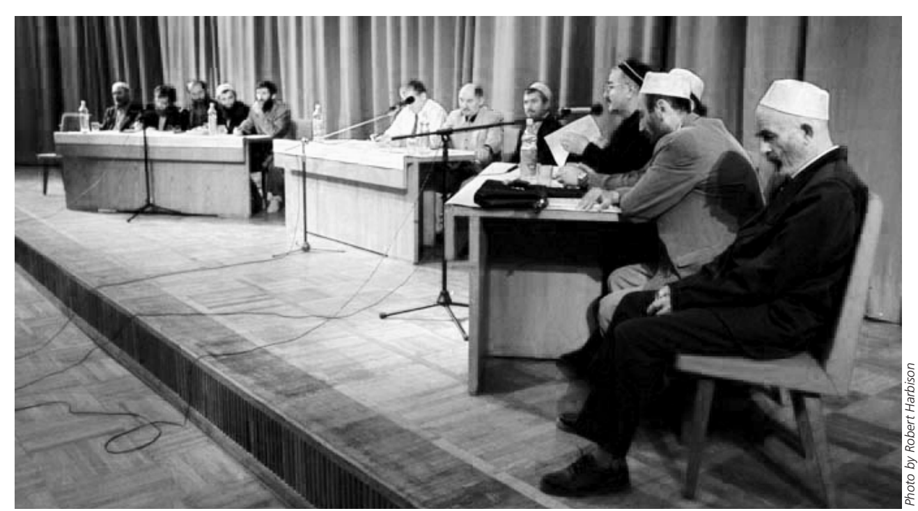
Intellectual debate flourishes in the contemporary Islamic world. In this public forum in Dagestan, a predominantly Muslim region of the Russian Caucasus, Islamists (left table) argue their case against traditionalists (right table).